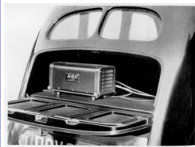
Typical mobile installation showing the transmitter/receiver in the luggage compartment of a car