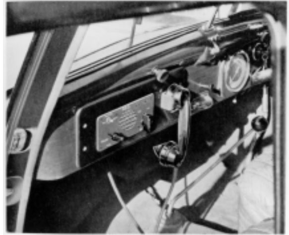
Mobile controller installed on the dashboard of a car

(From 'Applications of V.H.F. radio' by E.W. Northrop, GEC Journal, XVI, 4, pp. 184-196, 1949)